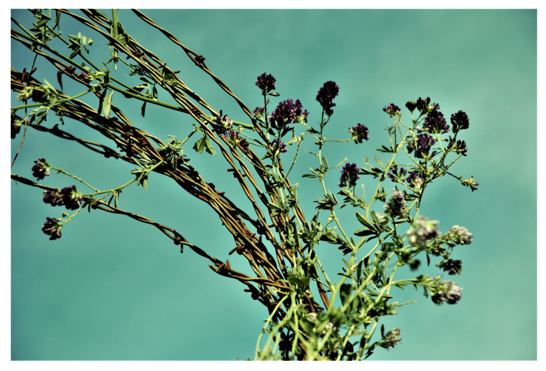
taken near Center, North Dakota.

The Dakota Conference Communication Department is always looking for beautiful photos to use in the Dakota Dispatch , Dakota Messenger , the website, and more. If you are willing to share, please send them to j.dossenko@gmail.com with the name of the photographer and a short description of where it was taken.