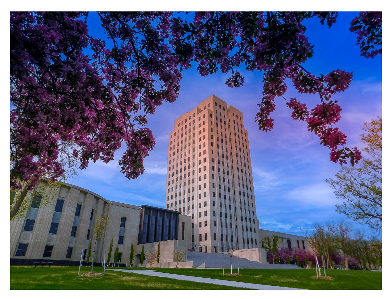
Photo by Paulette Bullinger of the North Dakota Capitol Building and tree blossoms.

The Dakota Conference Communication Department is always looking for beautiful photos to use in the Dakota Dispatch , Dakota Messenger , the website, and more. If you are willing to share, please send them to j.dossenko@gmail.com with the name of the photographer and a short description of where it was taken.