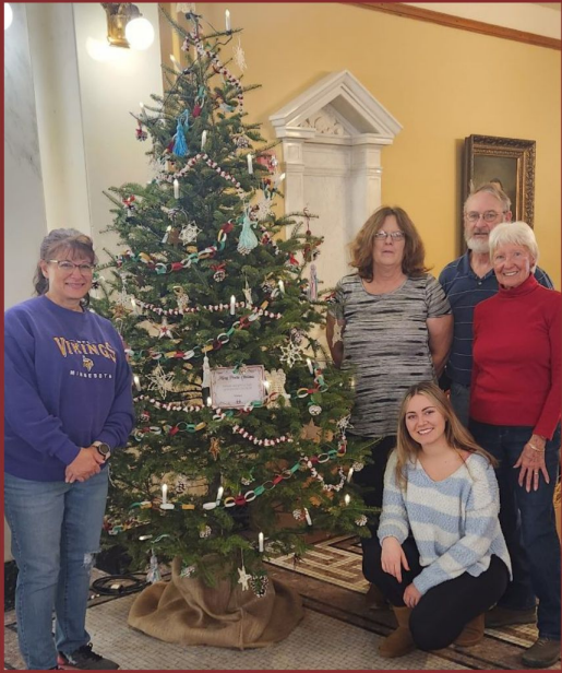
Members of the Pierre Adventist Church stand beside their decorated Christmas tree.