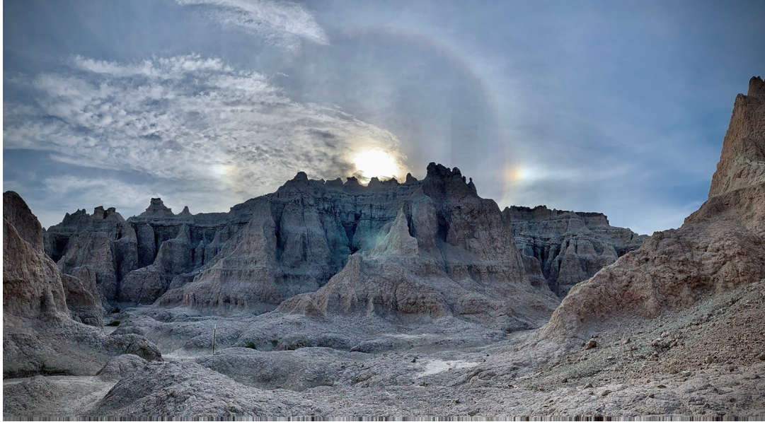
Photo from the Badlands National Park in South Dakota

If you have local church news or stories to share, please send event information, news suggestions and/or articles, and pictures to: j.dossenko@gmail.com