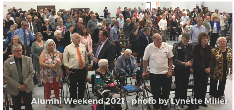
Alumni Weekend 2021