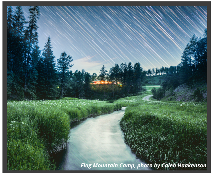
Flag Mountain Camp, photo by Caleb Haakenson

2020 has thrown many curveballs and difficulties as we continue to try to adapt to the "new normal." We are so grateful for the ability to host a few in-person events with the help of some masks, a lot of hand sanitizer, and many helping hands to make sure safety is a priority. We are planning for some virtual events that will be available to our youth, young adults, Pathfinder and Adventurer leaders, and continue to pray for more opportunities to safely gather together in the future. Please keep the young people of our conference in your prayers as we see them grow into mature disciples of Christ and continue to bring the transformation of the Kingdom of God to this world.