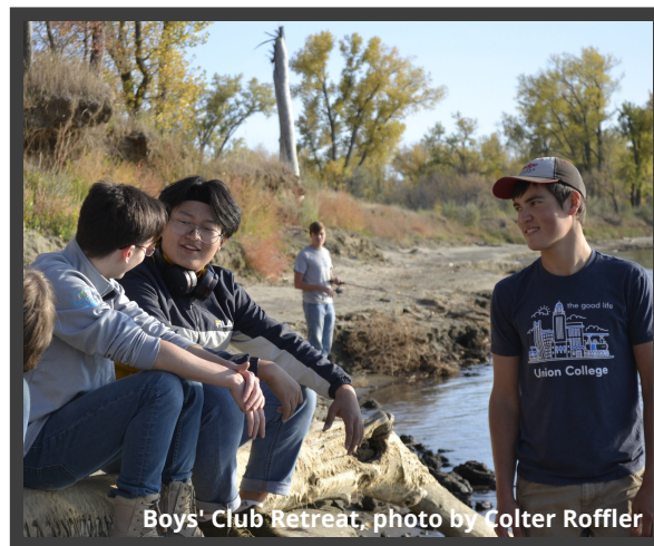
Boys' Club Retreat

As I reflect on DAA’s first quarter, I know our students are thankful for the opportunity to go to school in a familiar setting: Rarely having to mask and distance adds to our family atmosphere. In spite of the changes around us, we are able to maintain some normalcy, face to face learning, time with friends, and bit of fun along the way.