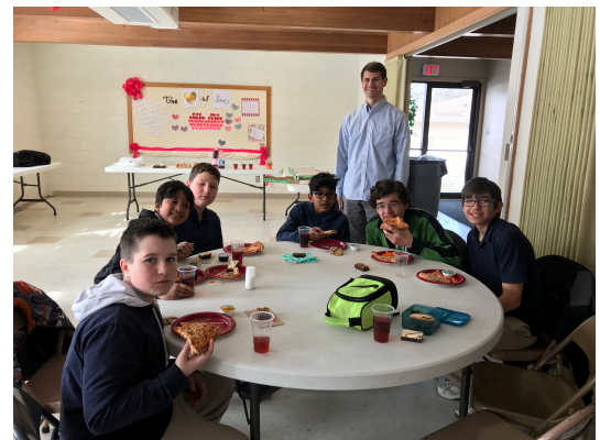
Top Right: Red River Adventist Elementary "boys' school" enjoys a pizza lunch.