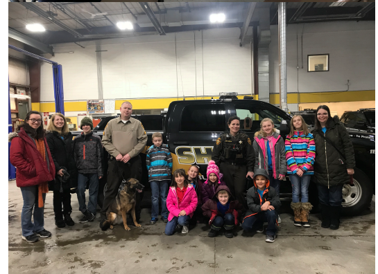
Bottom Right: Brentwood Adventist Christian visit fire department.