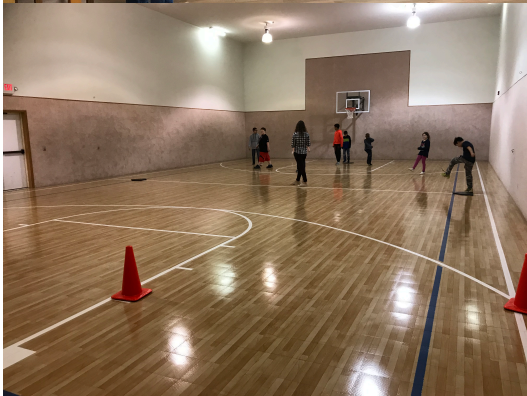
Bottom Left: Sioux Falls Adventist Elementary students play on new gym floor.