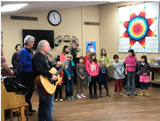
Top Left: Rapid City Adventist Elementary sings at nursing home.

In her free time she enjoys being outdoors, hiking and traveling. This summer will find her spending a few weeks in Honduras again.