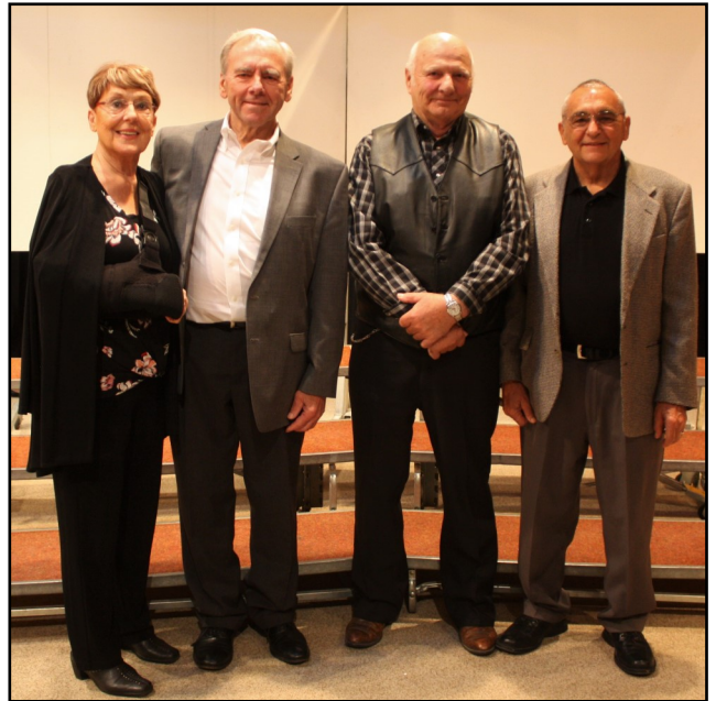
60 Years - Class of 1959