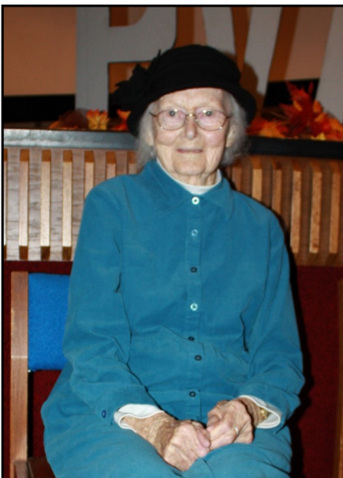
85 Years - Class of 1934