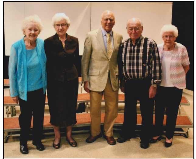
70 Years - Class of 1949