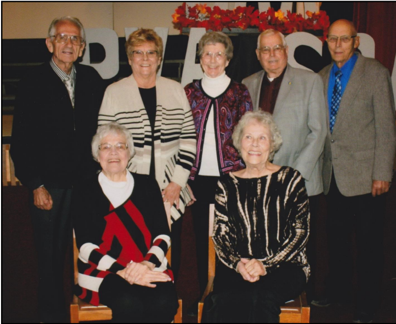
65 Years - Class of 1954