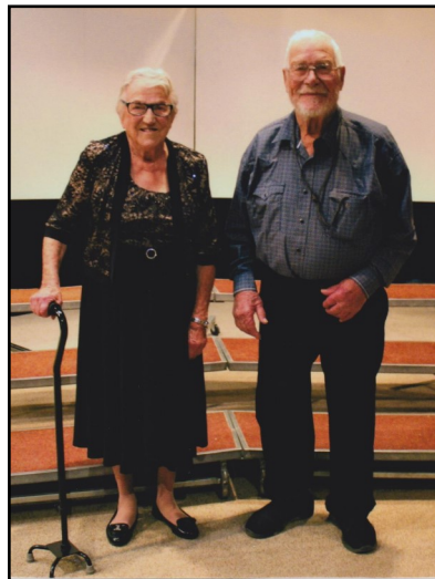
75 Years - Class of 1944