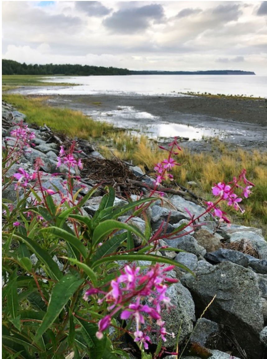
Aug 10 Dispatch Photo