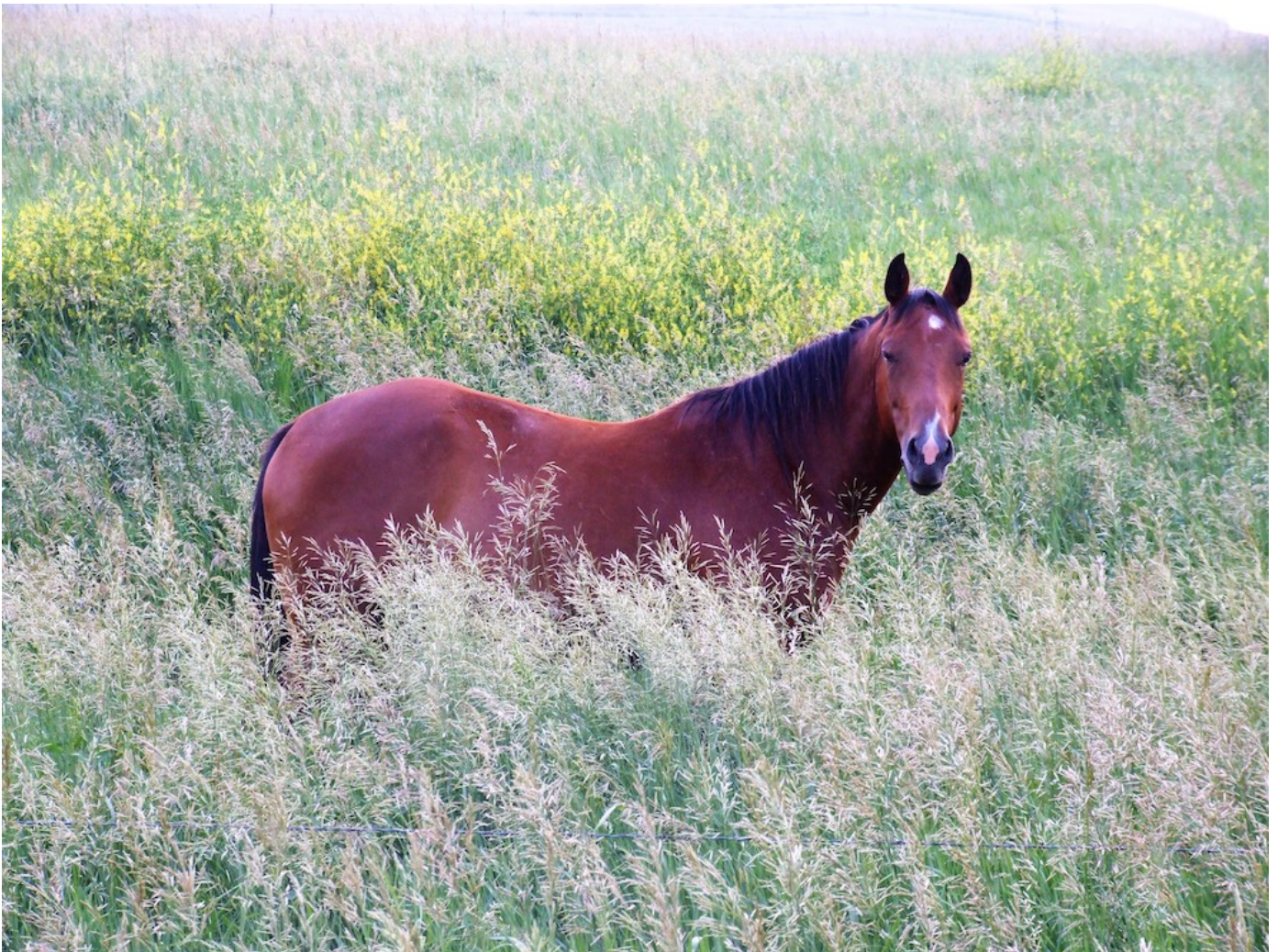
Photo by Charles O'Hare taken near Faith, SD with a Fuji FinePix S 9000.