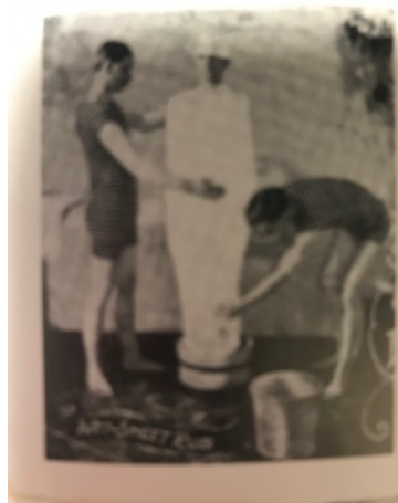
Photos Left to right: The Gastric Douche, The Vapor Douche, and The Wet-Sheet Rub