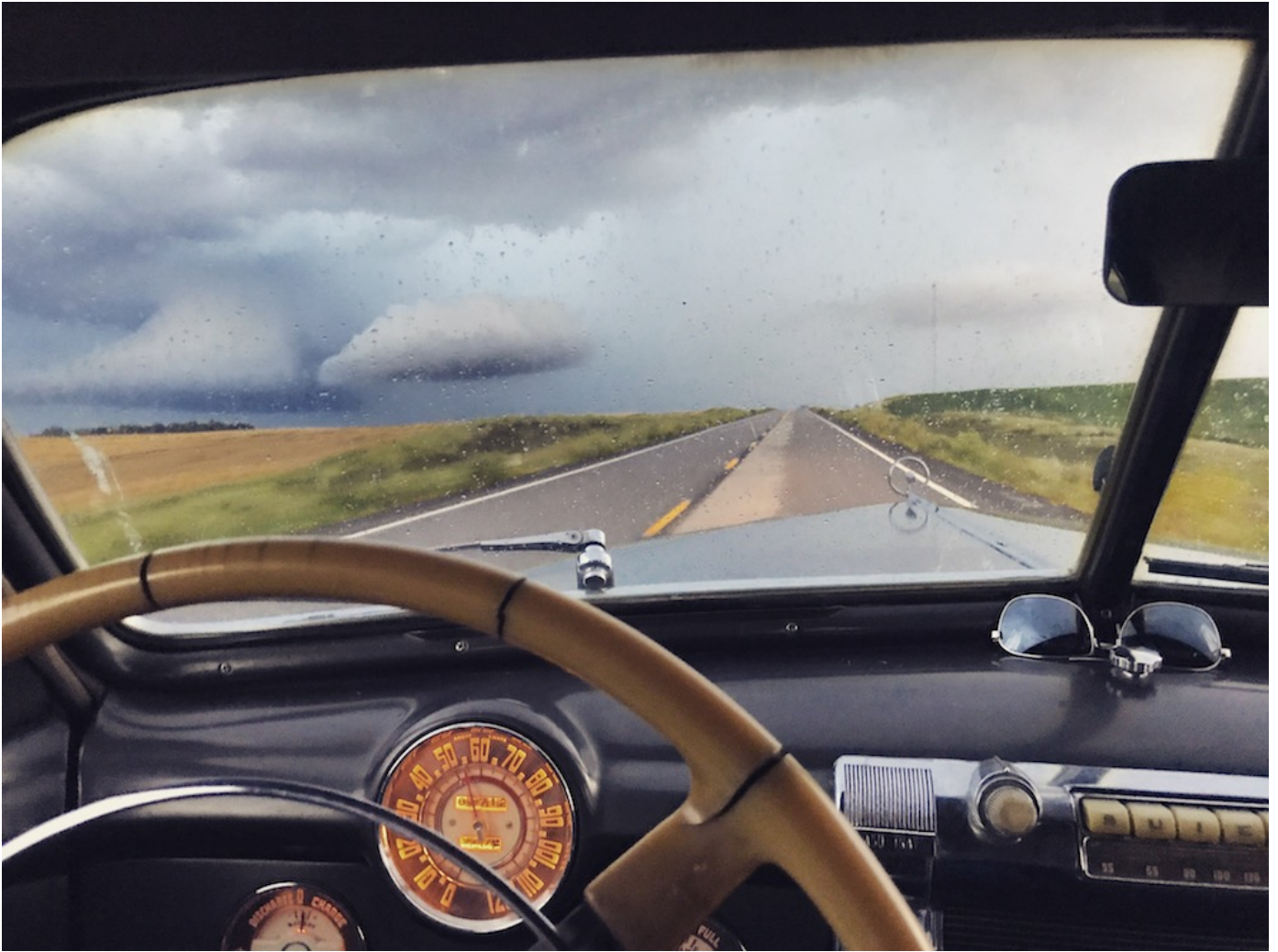
from inside a 1947 Buick, traveling home from Dakota Adventist Academy on Hwy 1804 or Hwy 13, North Dakota.