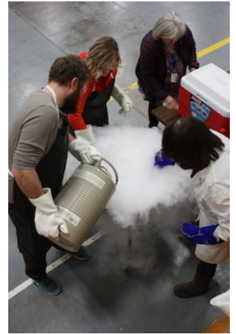
Article & photo by Tracy Peterson